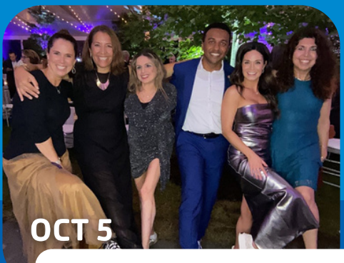
A Night of Magic